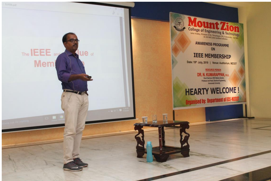
Awareness programme on IEEE membership was organized on 19-07-2019